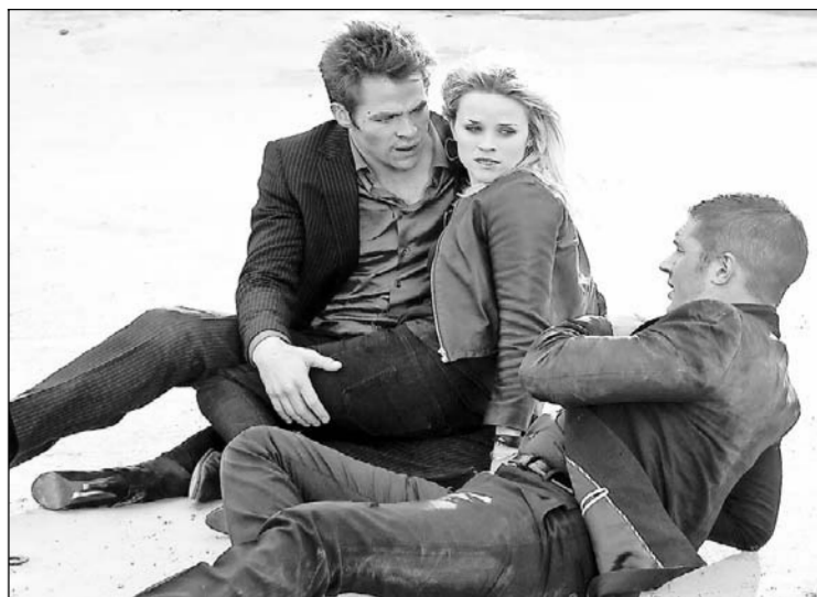
PG-13-rated War story: Lauren (Reese Witherspoon) is caught between two secret agents, FDR (Chris Pine, left) and Tuck (Tom Hardy).

Hardy, sporting a longish beard in preparation for his upcoming Mad Max shoot, had a different tactic. "Cake, sugar, cigarettes," says Witherspoon, "so she goes to